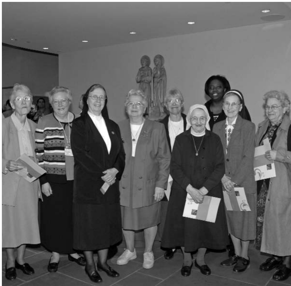
Members of the Sisters of the Sorrowful Mother gather on April 4 to see the official transfer of sponsorship of Saint Clare's to Catholic Health Initiatives.

facilities within the CHI family of hospitals and healthcare organizations.