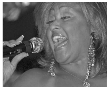
Darlene Love , renowned musical artist, Broadway performer and member of the Rock-and-Roll Hall of Fame, entertained Gala guests with a one-night only performance of a number of her chart-topping hits.