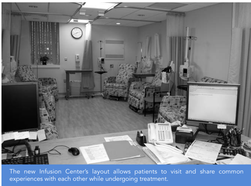
The new Infusion Center's layout allows patients to visit and share common experiences with each other while undergoing treatment.

For Cancer Care at Saint Clare's , the recent completion of the renovated and expanded Infusion Center has meant the ability to streamline the provision of advanced oncology treatment for both patients and physicians alike. For the hundreds of Northwest New Jersey cancer patients who have been treated in the Center since its opening late last fall, it has meant the comfort and convenience of being able to receive their therapy from healthcare professionals they trust in a state-of-the-art facility right in their own communities.